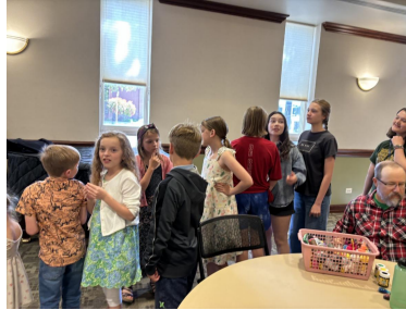
Waiting for a turn.