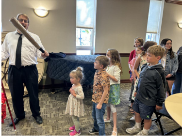
I'm supposed to hit...who?

Together we made boxes for our college/military folk, made kits for those who are homeless, gifts to give to our shut-ins, advent wreaths, made blankets and raised money for our youth missions and a few other things. We completed our Sunday Funday goal of providing intergenerational fellowship and working on a variety of mission projects. Thank you!