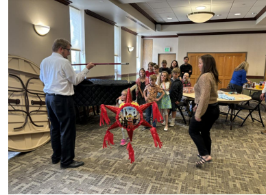
Sunday Funday Finale.